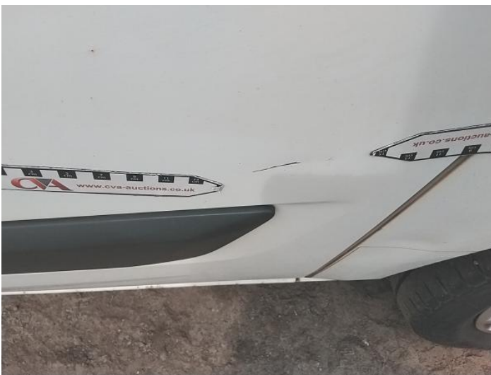
7: Qtr Panel nsr Dented With Paint Damage