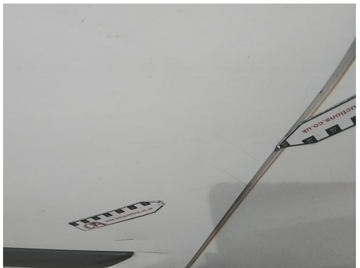
8: Qtr Panel nsr Scratched Over 25mm Thru Paint