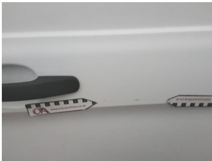
2: Qtr Panel nsr Scratched Over 25mm Thru Paint