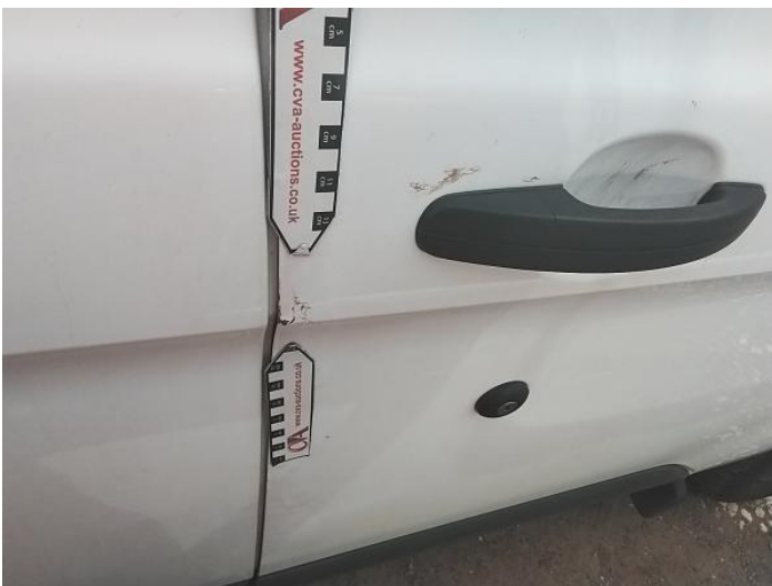
13: Door osf Dented With Paint Damage