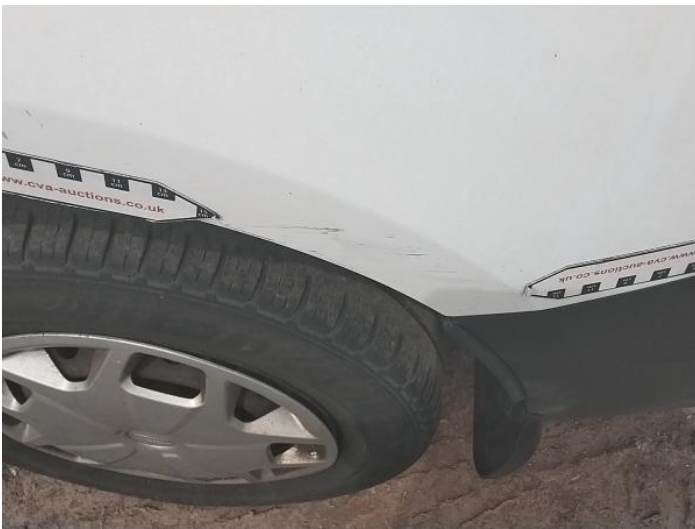
11: Qtr Panel nsr Scratched Over 25mm Thru Paint