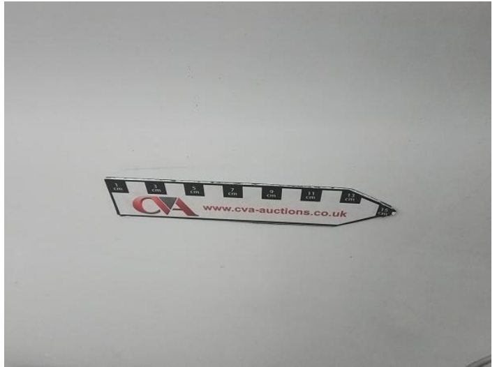
4: Door nsf Scratched Over 25mm Not Thru Paint