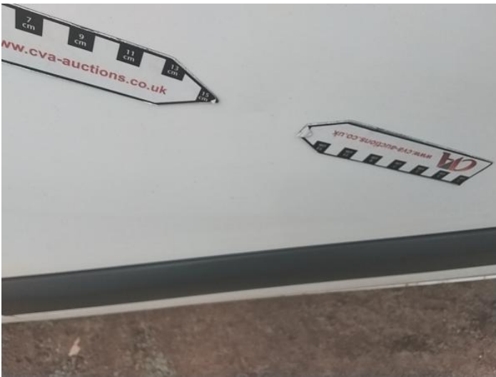
5: Qtr Panel nsr Dented Over 30mm