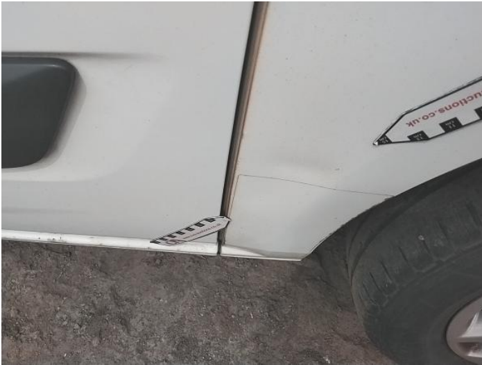
9: Qtr Panel nsr Dented Over 30mm