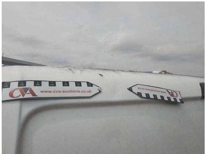
12: Door nsr Dented Over 30mm