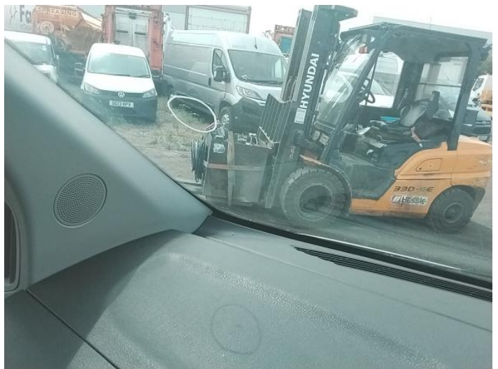
14: Screen Front Chipped Over 10mm