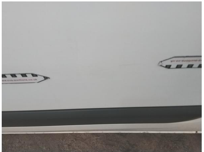
6: Qtr Panel nsr Scratched Over 25mm Thru Paint