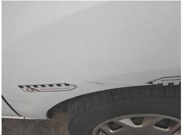
10: Qtr Panel nsr Scratched Over 25mm Thru Paint